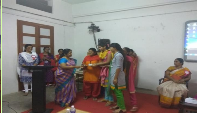
Prize Distribution for Paper Presenters in Valedictory Function