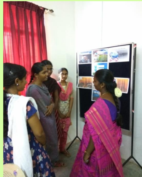
Oral and Poster Presentation