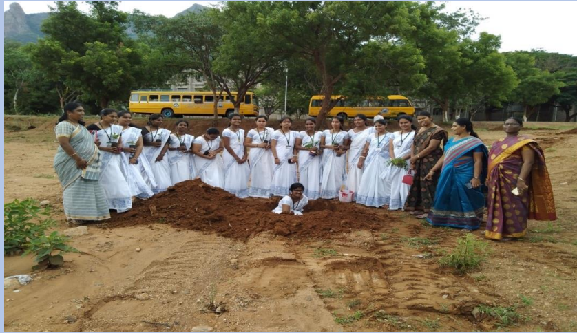
Tree Plantation Activity