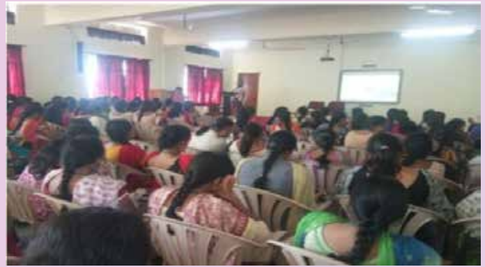
Special Lecture on 'Capacity Building Workshops for Counselors'