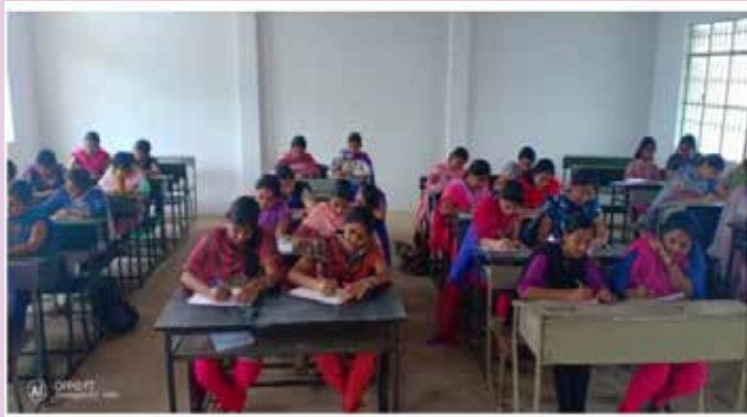
IETE Students' Forum Activity (Technical Quiz)