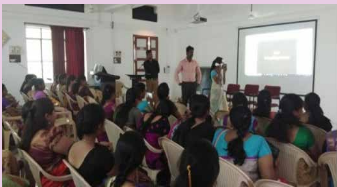
Seminar on 'UI/UX Design and Development'