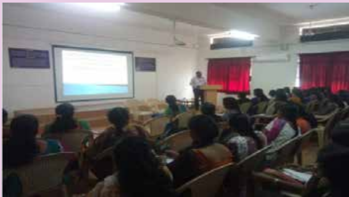
Guest Lecture on 'Applications of Optimization Techniques in Real World'