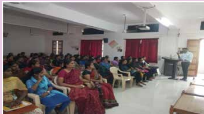
Special Lecture on 'Error Control Codes in Digital Communication'