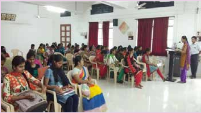
Seminar on 'Fiber Optic Communication'