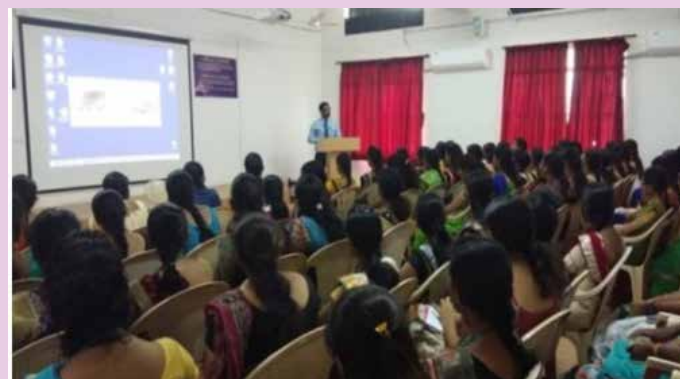
Guest Lecture on 'Industries expectations on Engineers'