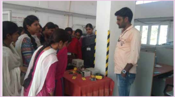
Industrial visit at Versa Drives, Coimbatore