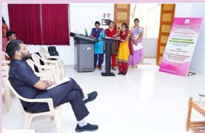
Paper presentation session