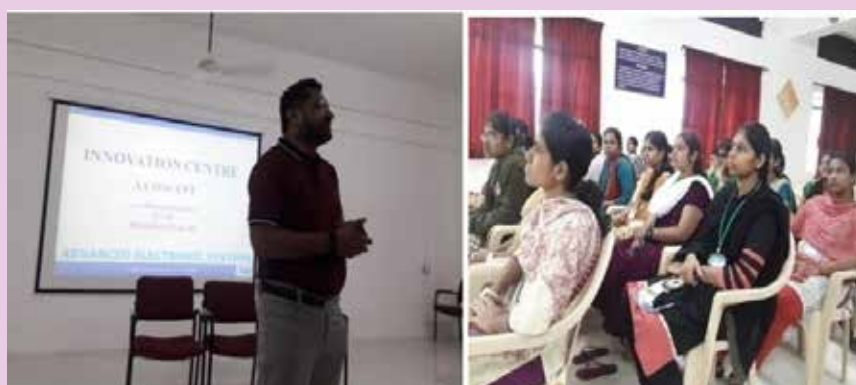
Special Lecture on 'Embedded Systems'