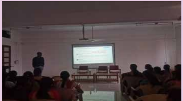
Guest Lecture on 'Recent Trends in Networking Security and IOT Applications'