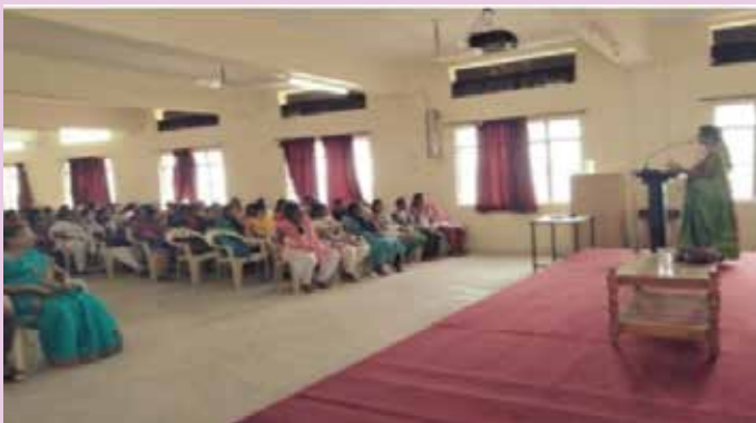
Special Lecture on 'Tamizhar panpadum Ariviyalum'