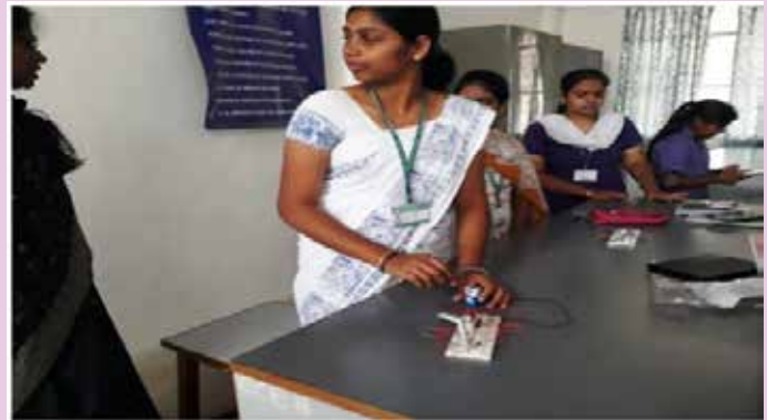
IETE Students' Forum Activity (Mini Project Display)