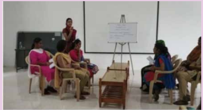
Debate on the topic 'Akkala kavidhagal, Ikkala avidhaigal'- Bharathiar Memorial Day