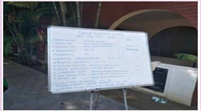
Tamil Mandram 'Competitions at Kongu Engineering College'