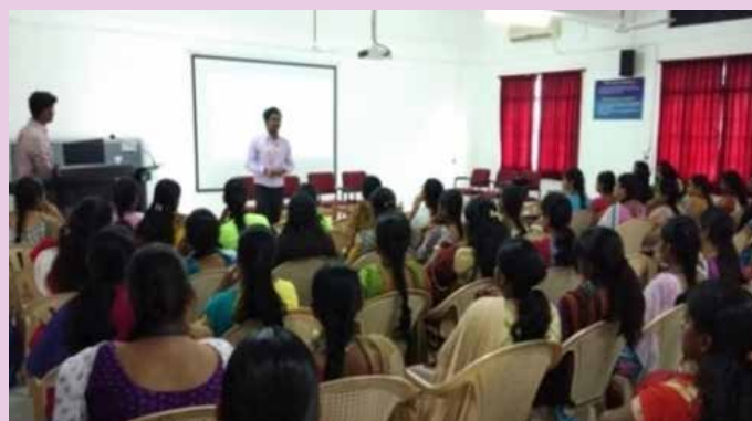
Seminar on 'IOT using Raspberry-Pi'