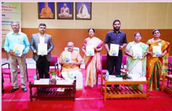
Release of Proceedings of the conference